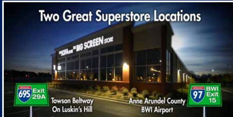
Two Great Superstore Locations