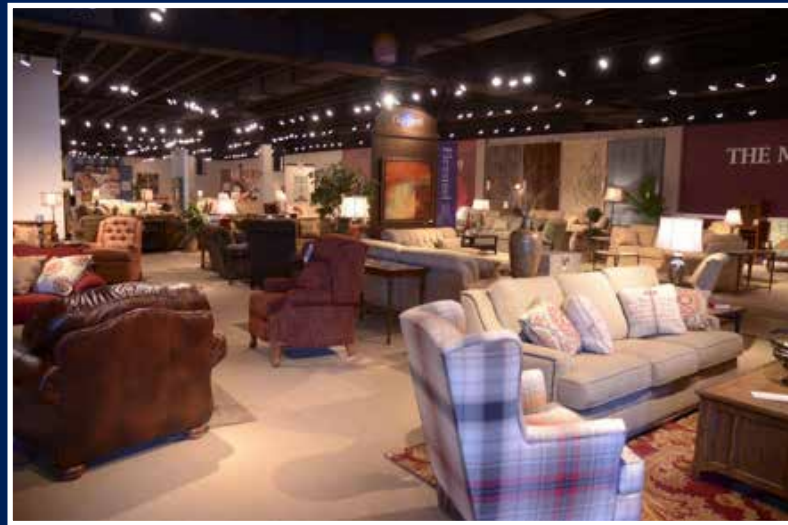
SOFA STORE INTERIORS Towson MD, 50,000 SF