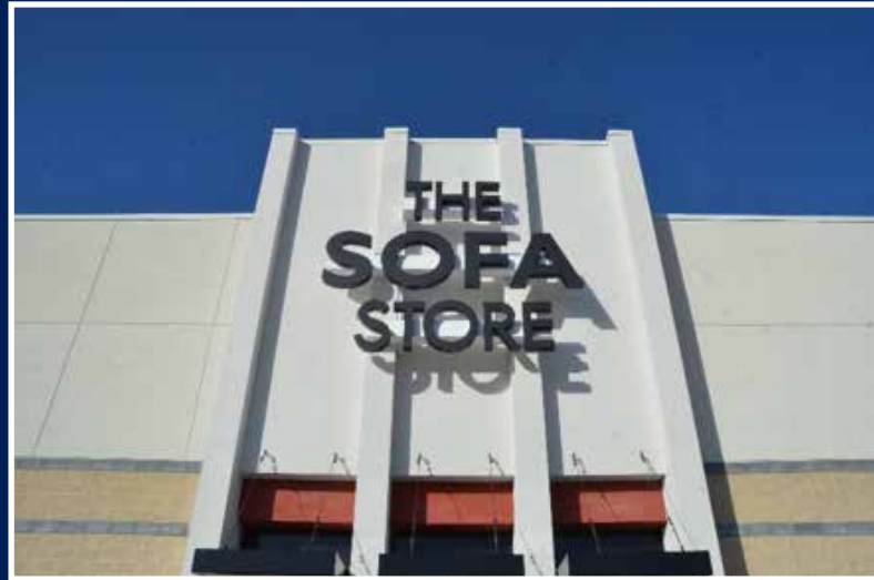
SOFA STORE STRUCTURE 50,000 SF Townson MD