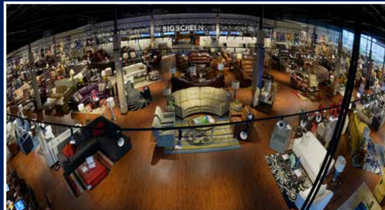
SOFA STORE INTERIORS Glen Bernie, Md, 40,000 Sf With Custom Built In Signage And Graphics